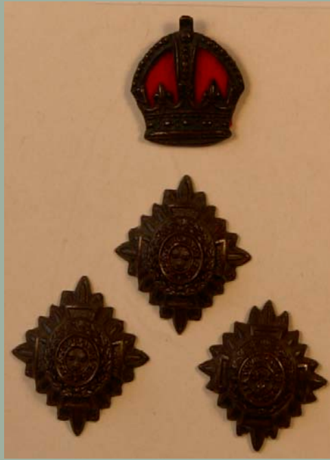
KHAKI SERVICE DRESS No. 11 DRESS Pre-1952