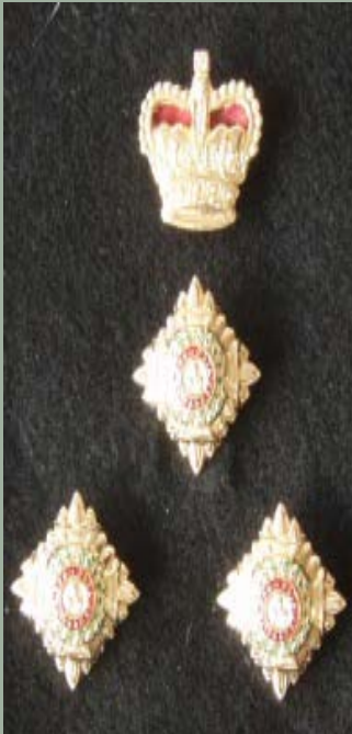
NSN No. 8455-99-869-3628 (CROWN)

Colonel Commandant till 1929 (ref: Dress Regulations July 1922 )