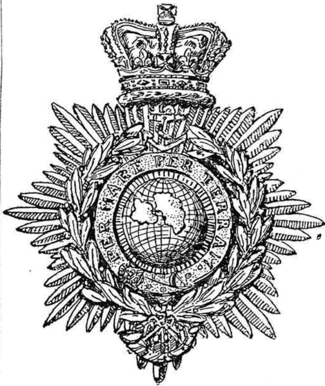
OFFICER'S SHAKO-PLATE (R.M.L.I.), 1866-1866. Gilt. Globe, Anchor and Bugle Silver.