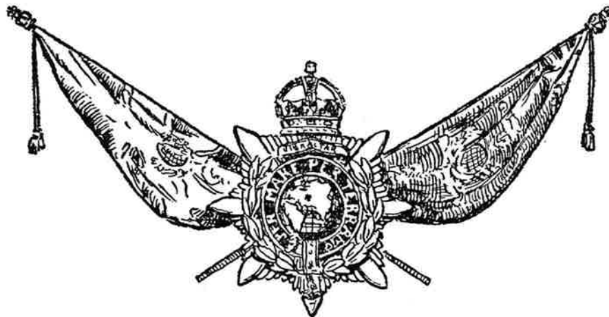
THE COLOURS AND OFFICER'S HELMET PLATE, 1905. Plate rather more than half actual size.