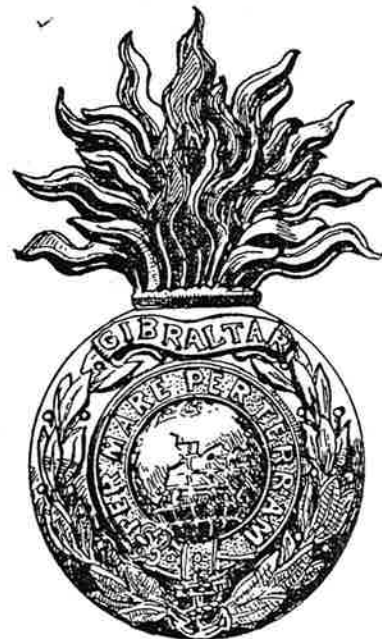
HELMET PLATE, 1904.