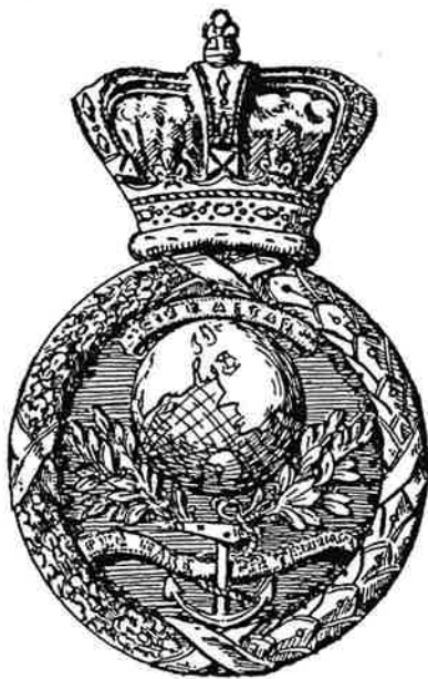
Private's Shako Plate, 1854.