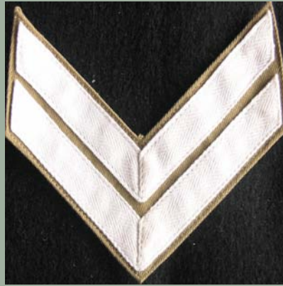
NSN No. 8455-99-416-5559 VOCAB NOS: 35931 STONE COLOURED SHIRT No. 5S, 6W, 8W AND No. 10 DRESSES (ref: AFO 2373 1955 )