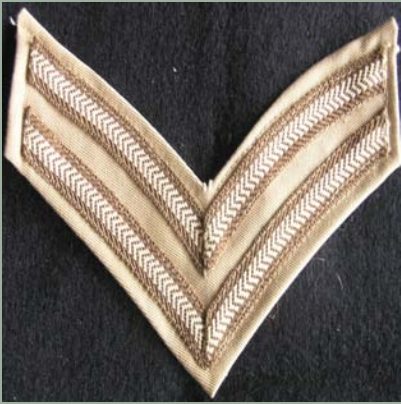
VOCAB NOS: 87931 STONE COLOURED TUNIC No. 5W DRESS (ref: GO 134 1932 , RMO 18 July 1932 ) and ( RM Circular 22/6/1942 )