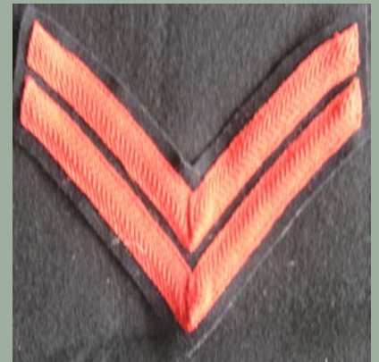
NSN No. 8455-99-4165558 (ref: DCI(RN) 58 200-4 ) VOCAB NOS: 32931 LIGHT BLUE SHIRT No 8 AND No. 10A DRESSES DRILL No. 3 DRESS