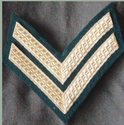
NSN No. 8455-99-416-5557 (ref: DCI(RN) 58 2004 ) VOCAB NO: 39931 LOVAT TUNIC No. 5 DRESS (ref: AUCC 27 1962 )