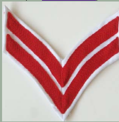
VOCAB NO. 32931 CHEF WORKING DRESS