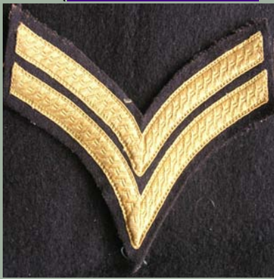
VOCAB NO. 31934 WHITE TUNIC (ROYAL YACHT)