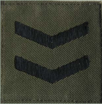
NSN No. 8455-99-135-9865 VOCAB NO. 88884 COMBAT JACKET No. 11 DRESS COMBAT SHIRT No. 11W DRESS ARCTIC WINDPROOF JACKET No. 8A and 11A DRESS HEAVY WOOL JERSEY No. 11A DRESS (ref: RMRO 74/131 , (RMRO 75/115) and (RMRO 83/30) )