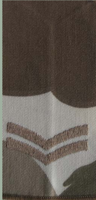
4D COMBAT DRESS "COMBATS"