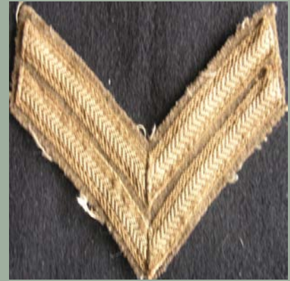
VOCAB NOS: 86931 GREATCOAT KHAKI SERVICE DRESS No. 11 DRESS