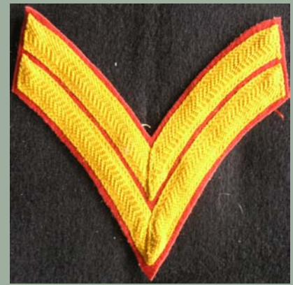
VOCAB NO. 38931