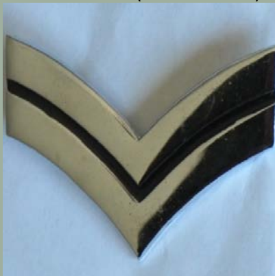
RSN/NSN No. V095-99-1353350 (ref: DCI(RN) 389 1984 ) VOCAB NO. 35050