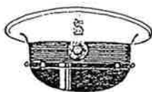
Other Officers (white cap cover)