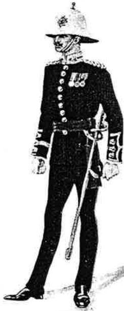
Royal Marine 1957