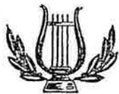
Bandmaster, 1st Class