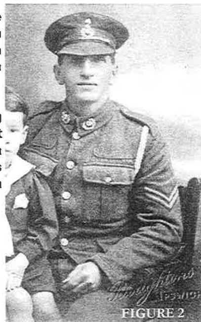
Fig 2: An RME corporal, again wearing RMLI pattern collar badges, a two part cap badge, a plain fused grenade over a globe and laurel. Not too visible in this copy but clear on the original, the man also wears RME shoulder titles.