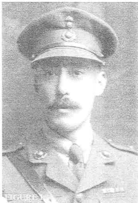
Fig 1: An RME officer circa 1918. The picture shows he wears RMLI pattern collar badges, a two part cap badge, on the fused grenade the letters RME can just be made out.

Most of us will be aware of the existence during WW1 of a specialist unit of RM Engineers, formed in 1917 to assist with construction at remote naval bases. The unit reached 10,000 all ranks by the war's end. Even the most specialist badge collecting books describe the badge worn by the unit as similar to a collar badge, simply a globe surrounded by a laurel with no separate ornament above. I have been in correspondence with several other collectors in recent months following the discovery of two photographs.