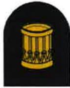
Fig 39E-23a. Drummer