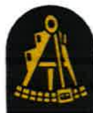
Fig 39E-14. Survey Recorder