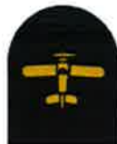
Fig 39E-18. Air (See Note)