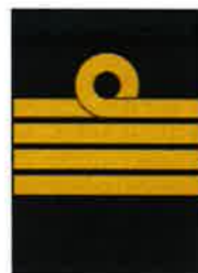
Fig 39E-7f. Captain