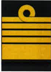
Fig 39E-7a. Admiral of the Fleet