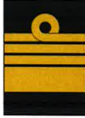
Fig 39E-7b. Admiral