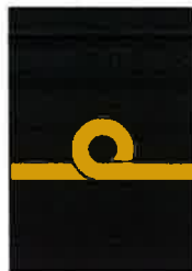
Fig 39E-7j. Sub-Lieutenant