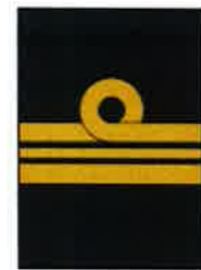
Fig 39E-7h. Lieutenant Commander