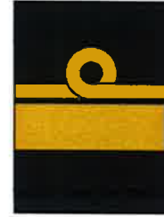
Fig 39E-7d. Rear Admiral