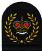
Fig 39E-15a. Master at Arms