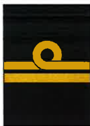
Fig 39E-7i. Lieutenant