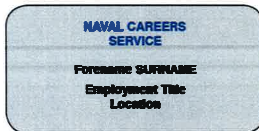
Fig 39E-25. Careers Service Officers and Careers Advisors

Worn centrally above the left breast pocket with the lower edge 3mm above the top seam or medal ribbon(s) when worn immediately above the pocket. If necessary, the badge may be displaced towards the left arm sufficient to prevent concealment by the left lapel. Not to be worn with medals.