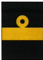
Fig 39E-7e. Commodore