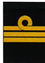
Fig 39E-7g. Commander