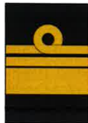
Fig 39E-7c. Vice Admiral