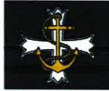
Fig 39E-7m. Chaplains' Badge (no sleeve lace worn)