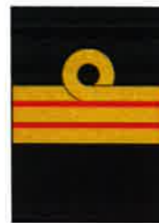
Fig 39E-7k. Medical Officers (See Note)