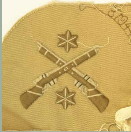
2 nd CLASS VOCAB NO. 87944 STONE COLOURED TUNIC No. 5W DRESS ref: RMRO 157 1950) and AFO 2373 1955)