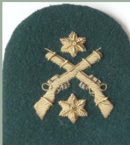
2 nd CLASS