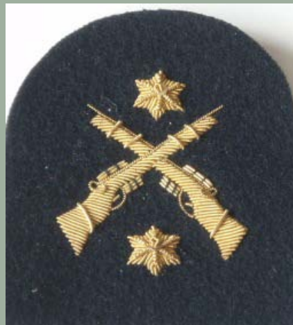
2 nd CLASS VOCAB NO. 31944 BLUE TUNIC No.1 DRESS