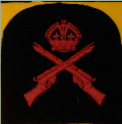
1 st CLASS VOCAB NO: 32943 DRILL No. 3 DRESS LIGHT BLUE SHIRT No 8 AND No.10A DRESS Pre-1952 (ref: RMRO 129 1952 ) and ( Annex A RM 15-12-63 1962 )