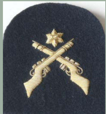
3 rd CLASS VOCAB NO. 31945 BLUE TUNIC No.1 DRESS (PLATOON WEAPONS ONLY)