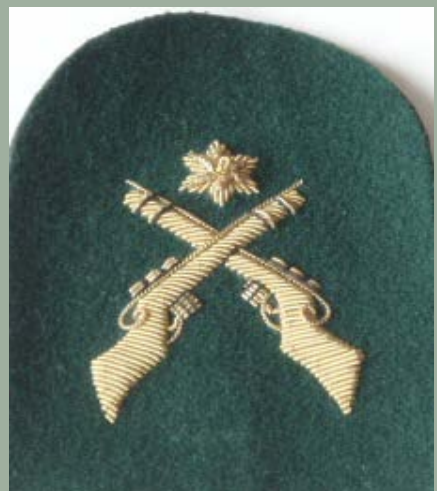
3 rd CLASS