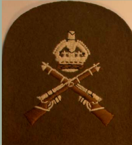
1 st CLASS VOCAB NO: 86943 KHAKI BATTLE DRESS No. 3A DRESS CEREMONIAL KHAKI DRILL NO. 6 DRESS Pre-1952 (ref: RMRO 129 1952) and ( Annex A RM 15-12-63 1962)