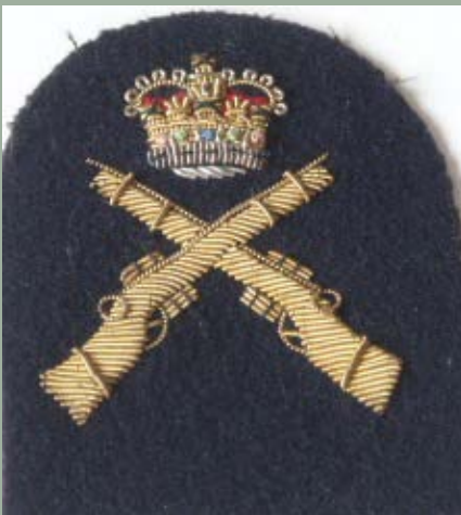
1 st CLASS VOCAB NO. 31943 BLUE TUNIC No.1 DRESS Post-1952