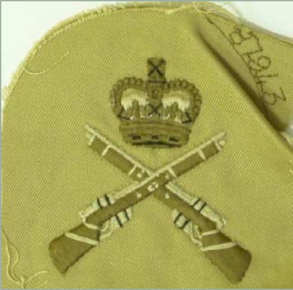
1 st CLASS VOCAB NO. 87943 STONE COLOURED TUNIC No. 5W DRESS Post-1952 ref: RMRO 157 1950) and AFO 2373 1955)