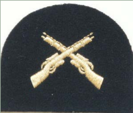
CURRENT NSN: 8455-99-236-5819 BLUE TUNIC No.1 DRESS