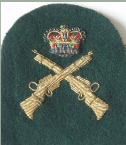
1 st CLASS