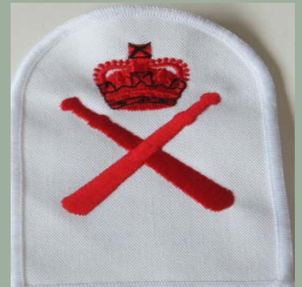
1 st Class VOCAB NO. 36245 WHITE VEST Post-1952 (ref: AFO 282 1956 )