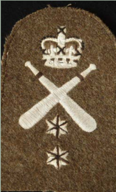
INSTRUCTOR VOCAB NO: 86242 KHAKI BATTLE DRESS No. 3A DRESS CEREMONIAL KHAKI DRILL NO. 6 DRESS Post-1952 ref: RMRO 129 1952 ) and Annex A RM 15-12-63 1962 )