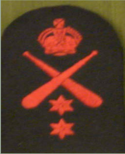
INSTRUCTOR VOCAB NO: 32963 DRILL No. 3 DRESS LIGHT BLUE SHIRT No 8 AND No. 10A DRESS Pre-1952