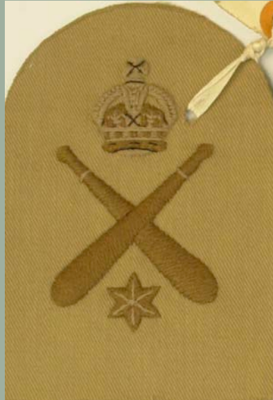
INSTRUCTOR 1 st CLASS 1932-1948 INSTRUCTOR 1948-1951 VOCAB NO. 87959 STONE COLOURED TUNIC No. 5W DRESS Pre-1952 ref: RMRO 157 1950) and AFO 2373 1955)