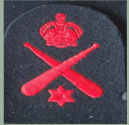
INSTRUCTOR 1 st CLASS 1932-1948 INSTRUCTOR 1948-1951 VOCAB NO: 32963 DRILL No. 3 DRESS LIGHT BLUE SHIRT No 8 AND No. 10A DRESS Pre-1952