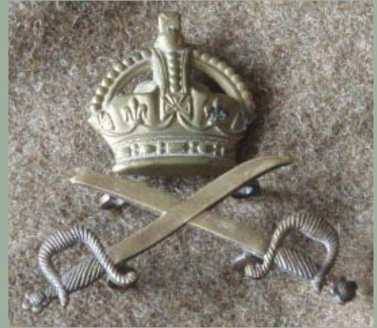
FIRST SERGEANT PHYSICAL TRAINING INSTRUCTOR (ref: GO 79 1892 )