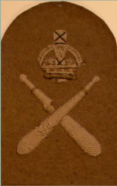
1 st CLASS VOCAB NO: 86964 KHAKI BATTLE DRESS No. 3A DRESS CEREMONIAL KHAKI DRILL NO. 6 DRESS Pre-1952 ref: RMRO 129 1952 ) and Annex A RM 15-12-63 1962 )