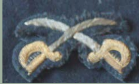
PHYSICAL TRAINING INSTRUCTOR (ref: GO 79 1892 ) and ( GO 32 1893 )