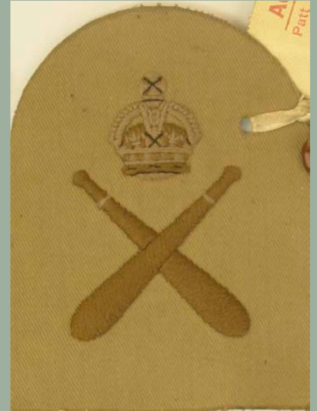
1st CLASS VOCAB NO. 87959 STONE COLOURED TUNIC No. 5W DRESS Pre-1952 ref: RMRO 157 1950) and AFO 2373 1955)