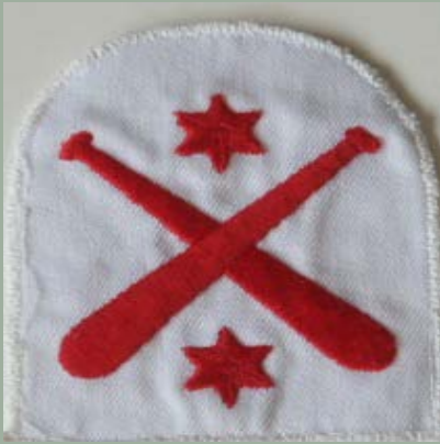
2 nd Class VOCAB NO. 36246 WHITE VEST (ref: AFO 282 1956 )