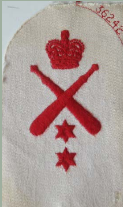
INSTRUCTOR VOCAB NO. 36242 WHITE VEST Post-1952 (ref: AFO 282 1956 )