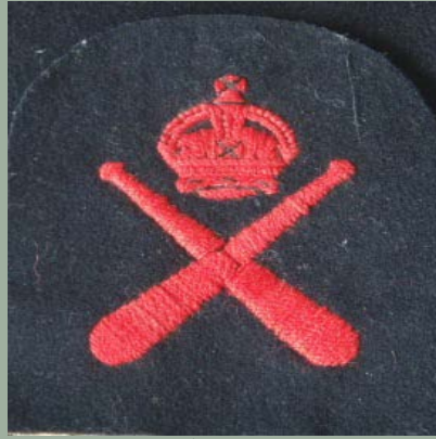
1 st CLASS VOCAB NO: 32963 DRILL No. 3 DRESS LIGHT BLUE SHIRT No 8 AND No. 10A DRESS Pre-1952