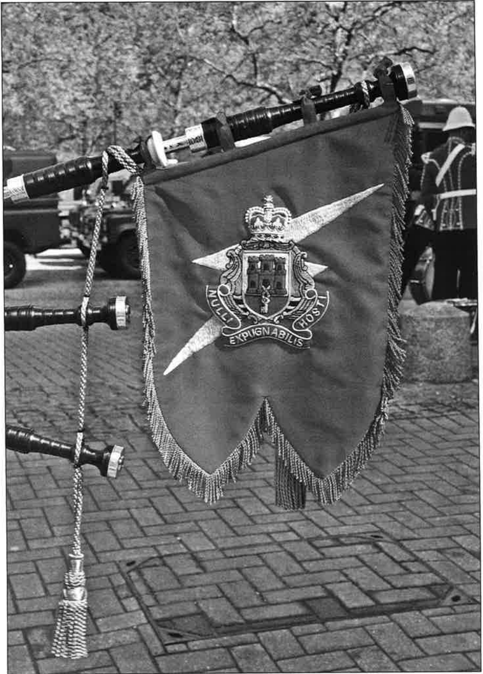
One of the scarlet pipe banners of the Royal Gibraltar Regiment bearing the Arms of Gibraltar.