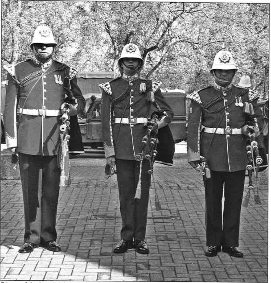
Pipers of the Royal Gibraltar Regiment, 2012.