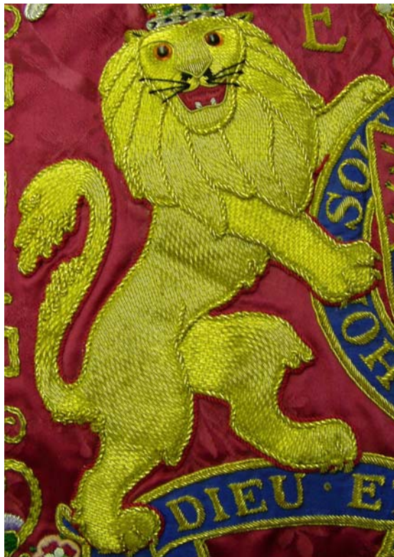
Figure 4. Lion