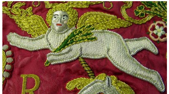
Figure 10. Border