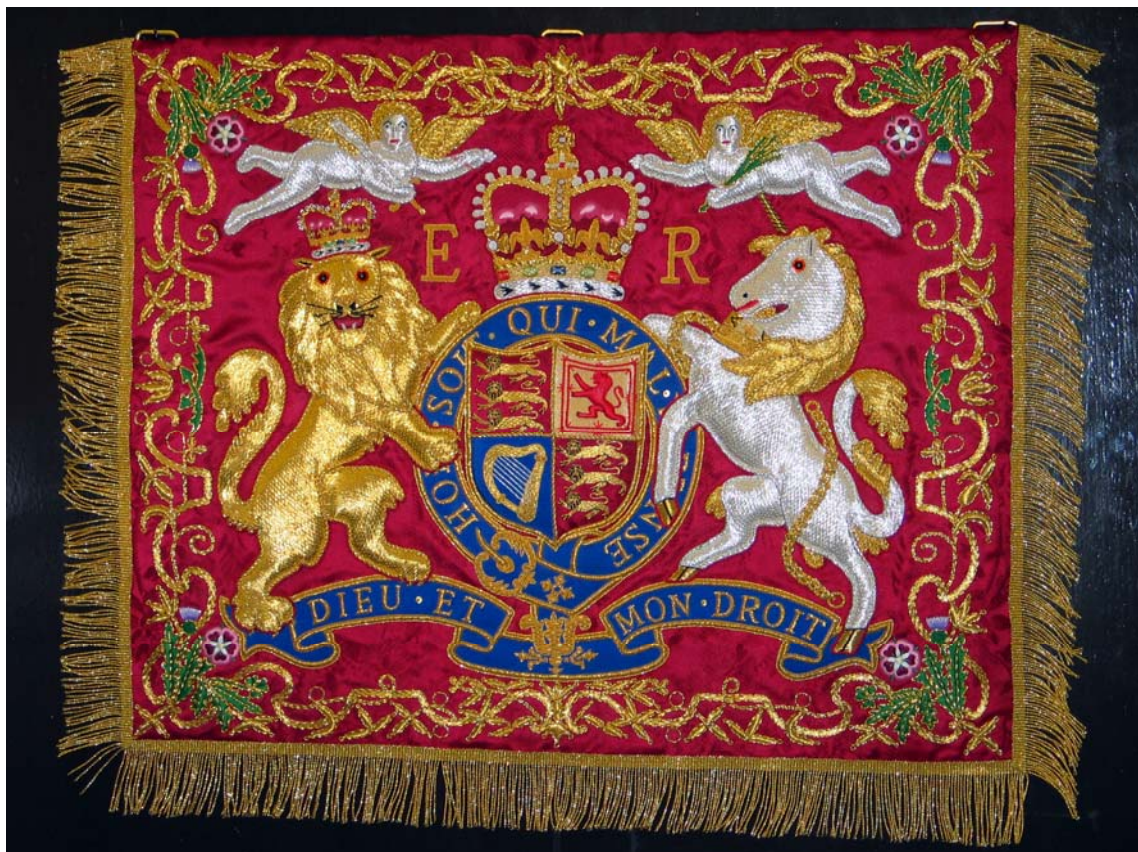
FIGURE 1. State Trumpet Banner