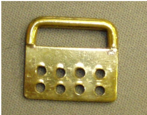
(i) Gilt Loop and plate