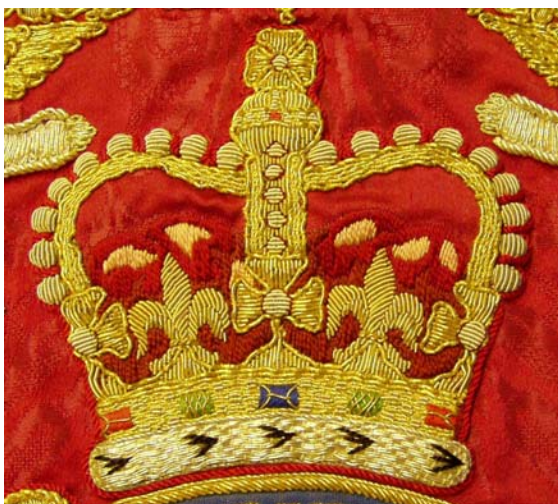
Figure 6. Large Crown