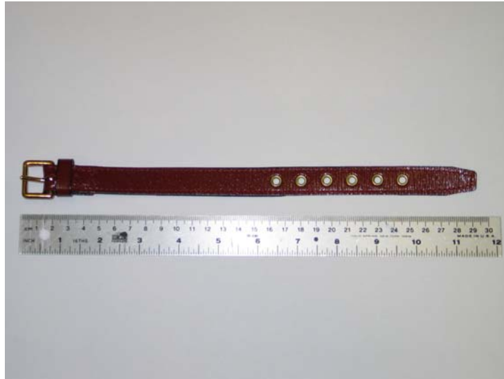
Figure 2. Red Morocco Leather Straps