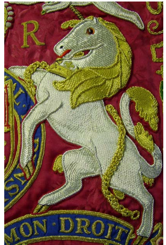
Figure 5. Unicorn